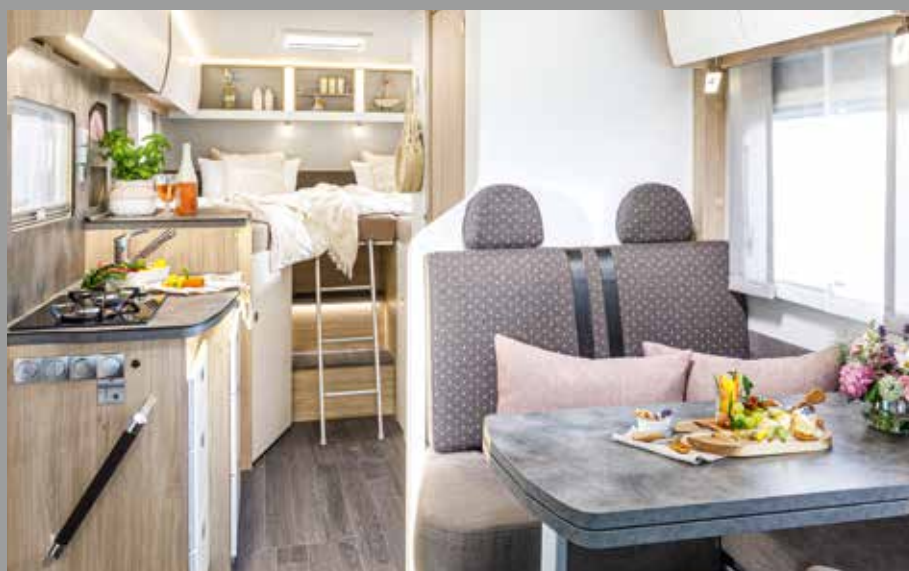
↑ This is how FREEDOM feels: 2 m of headroom throughout in all A-Class FRANKIA NEO vehicles

New solutions for even more space 2 m continuous height Available as a 3.5 t or 4.5 t vehicle Strong platform + modern design Optional drop-down bed in the front Agile vehicle length from 6.82 m Deluxe sleeping: GD (1.98 m / 2.0 m × 80 cm) or BD (2.03 m × 1.40 m)