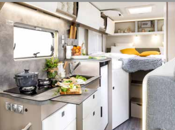
↑ HIGHLIGHT in the kitchen: refrigerator with up to 138 l volume