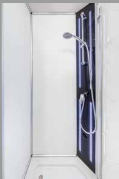
↑ REFRESHING SHOWER