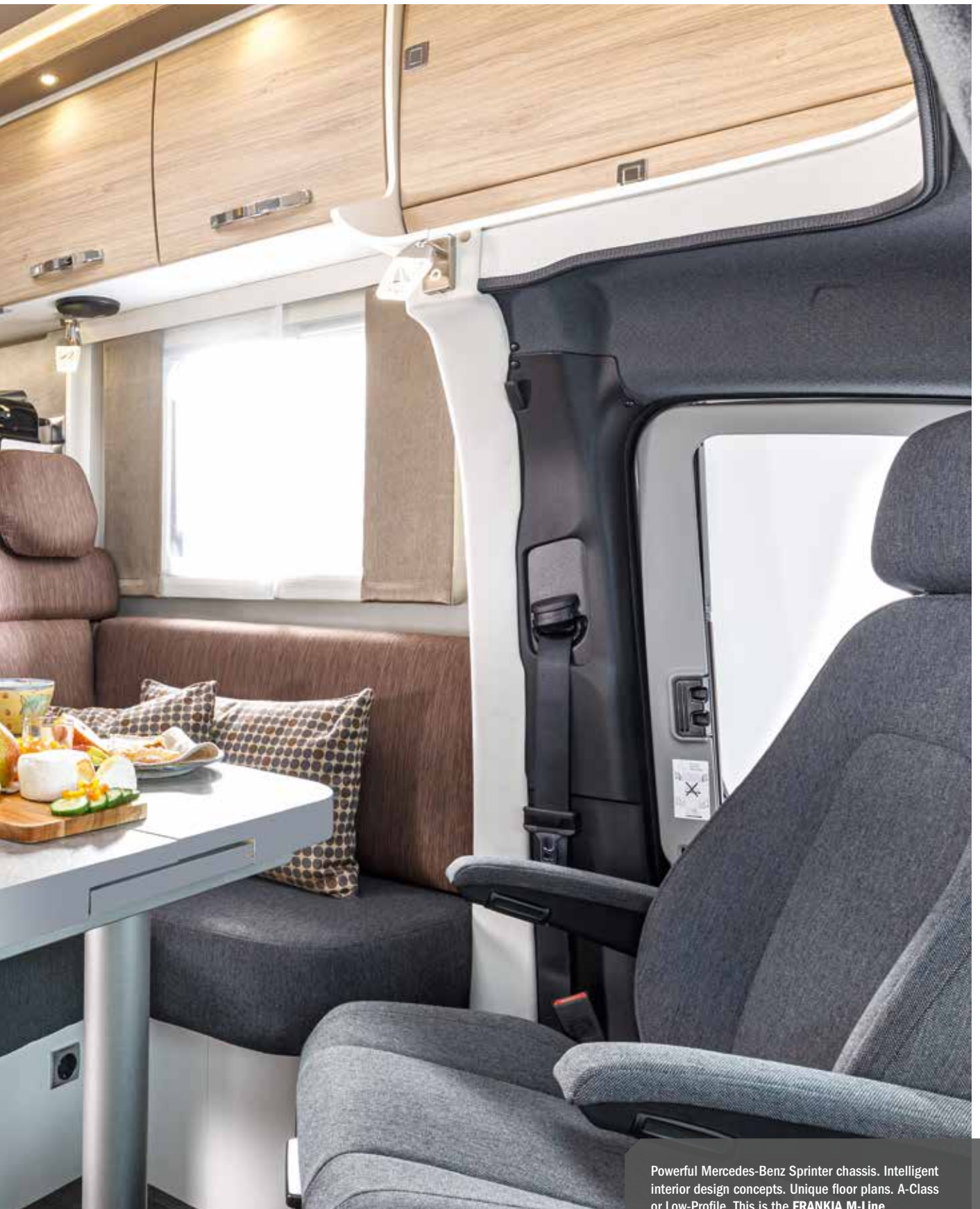
Powerful Mercedes-Benz Sprinter chassis. Intelligent interior design concepts. Unique floor plans. A-Class or Low-Profile. This is the FRANKIA M-Line.