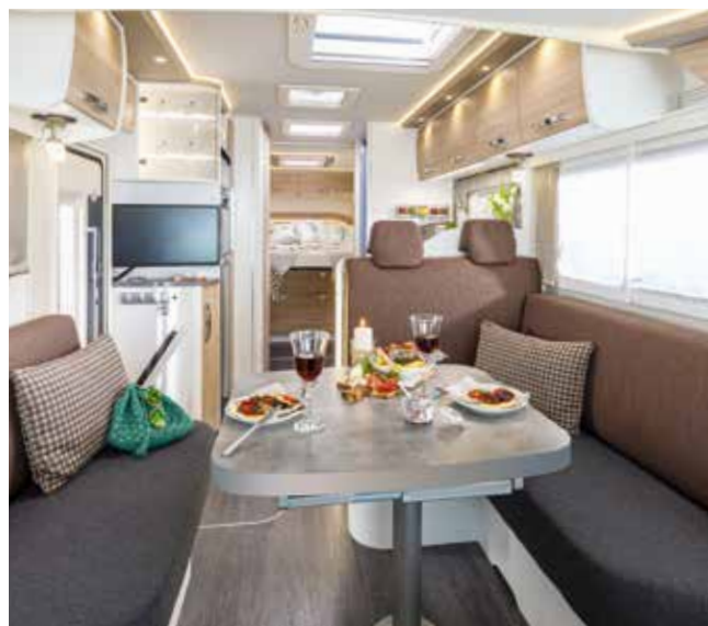
↑ Every FRANKIA PLATIN is UNBELIEVABLY SPACIOUS.