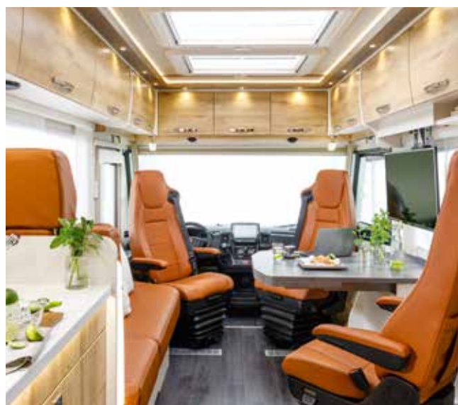
↑ Work and travel in the luxurious version: BAR STYLE SEATING in the FRANKIA TITAN