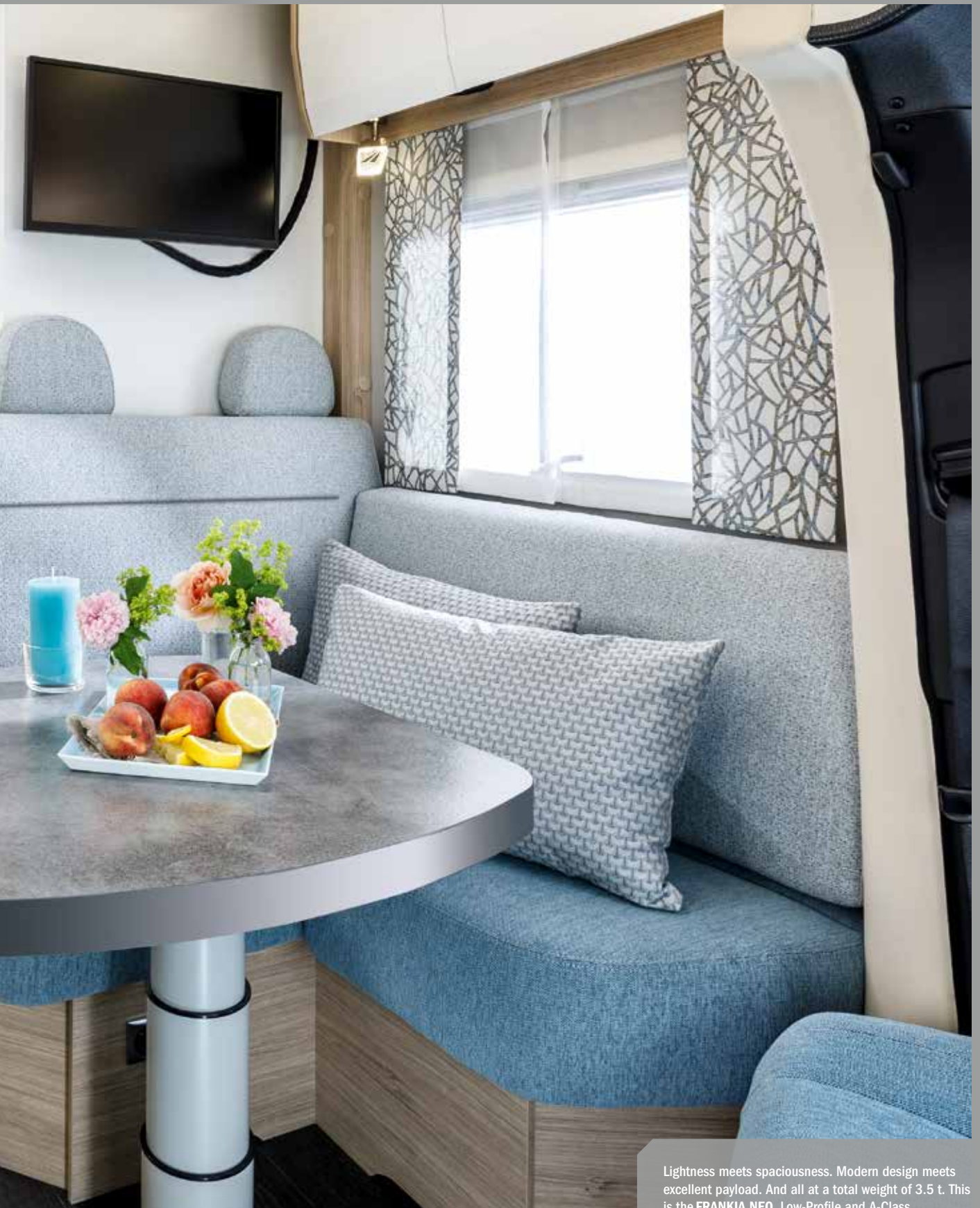
Lightness meets spaciousness. Modern design meets excellent payload. And all at a total weight of 3.5 t. This is the FRANKIA NEO. Low-Profile and A-Class.