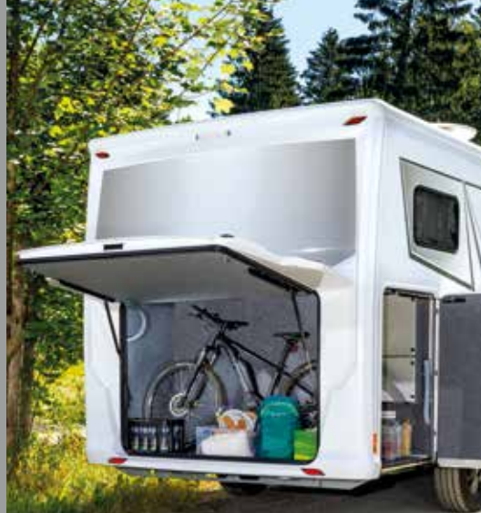
↑ PRACTICAL loading and unloading: The FRANKIA Smart-Load System

Upgrade: FRANKIA MT 7 NEO in the BLACK LINE Edition including its own design and additional features