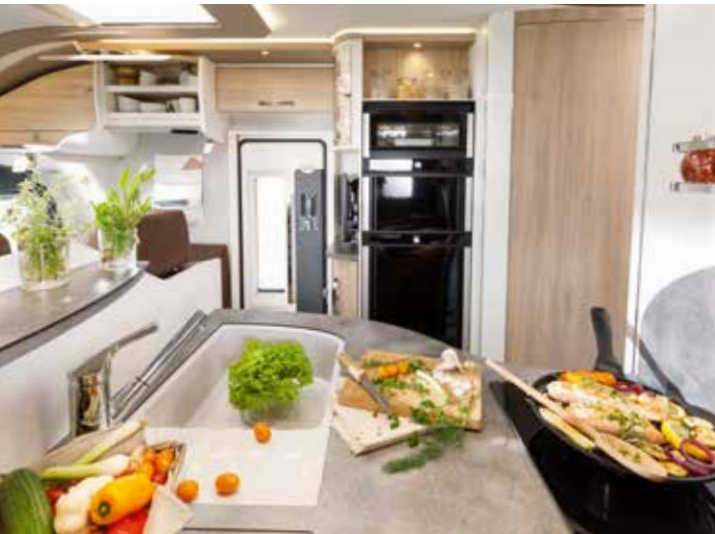
↑ Cook like you're at home: in the large FRANKIA MAXIFLEX KITCHEN