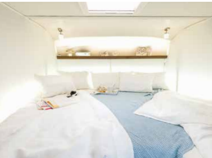
↑ Sleep, read, stream - you can do all this and more in the FRONT DROP-DOWN BED .