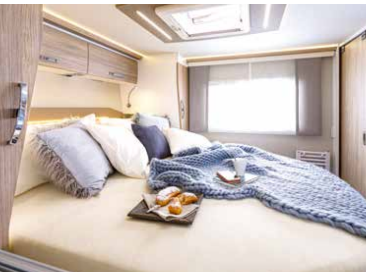
↑ There's more in store! XL QUEEN-SIZE BED with a width of 1.60 m