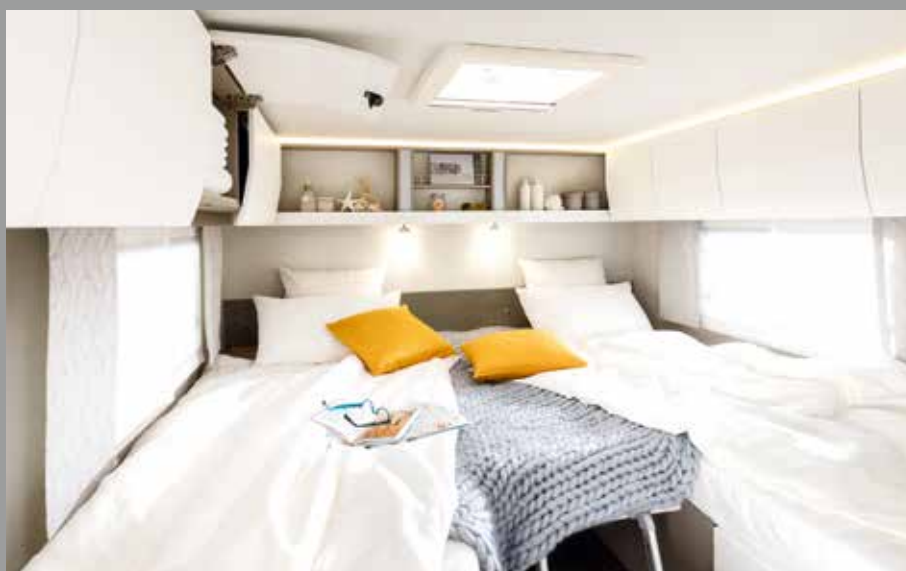
↑ Very GENEROUS for a lightweight: separate beds in the rear.