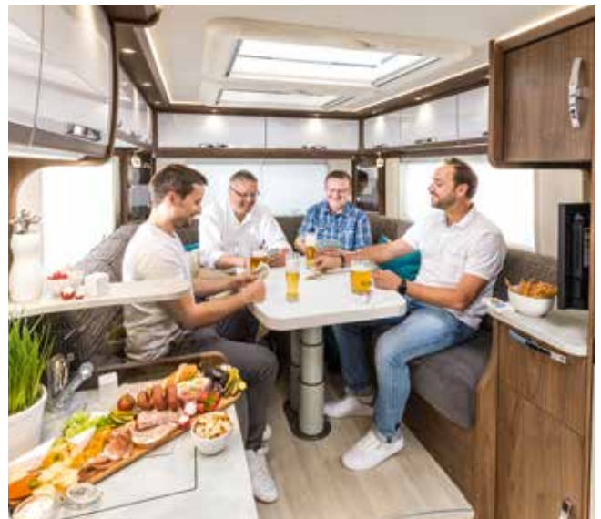
↑ THE ONLY one in its class: Round seating group meets Mercedes-Benz