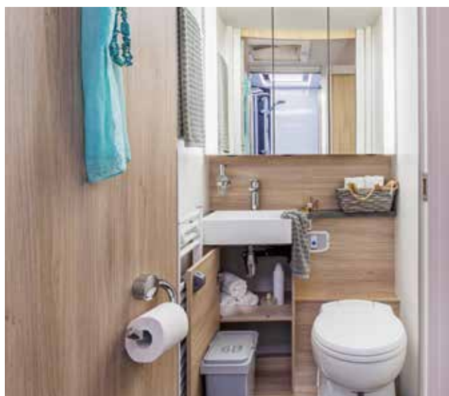
↑ Refreshingly luxurious: FRANKIA's SPA-LIKE BATHROOM!

2.03 m of headroom throughout Pure luxury with a length of up to 9 m Up to 2.10 m long GD beds One-of-a-kind lounge atmosphere Double floor with a continuous height of 35 cm Up to 250 l fresh water tank