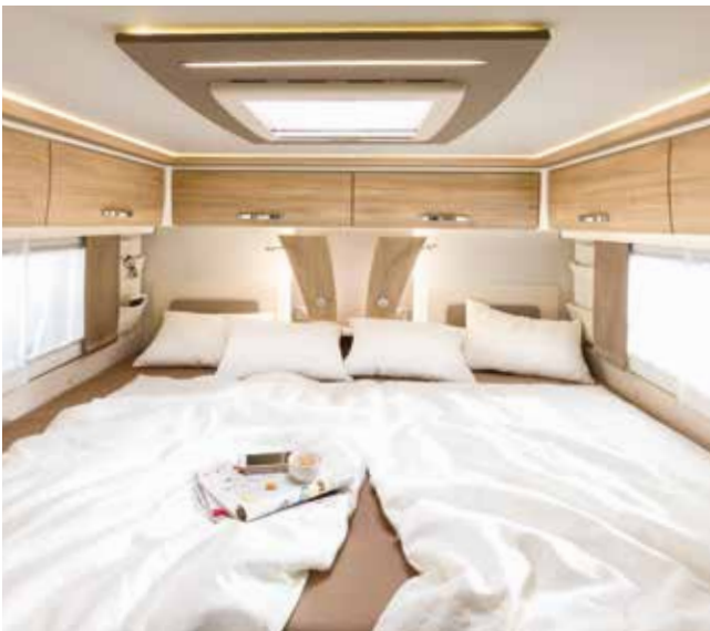
↑ So comfortable: separate beds with high-quality PLATE SPRING SYSTEM

Completely stepless double floor Clever storage solutions – inside and out