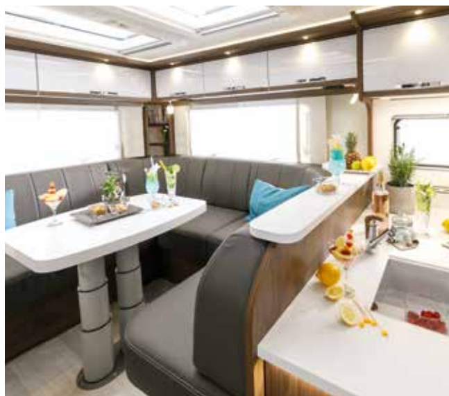
↑ Very FRANKIA: enjoy the comfort of the extra-large ROUND SEATING GROUP!

Spacious, spa-like bathroom Luxurious round seating groups 2.03 m of headroom throughout the stepless interior Up to 270 l fresh water tank Elegant leather upholstery (optional) New: unique exterior design