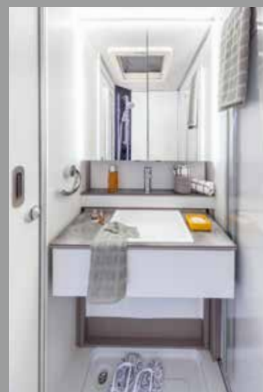
↑ REFRESHING: Smart bathroom