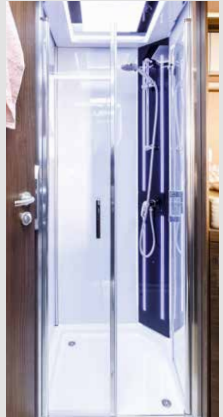
Ambient lighting in the shower