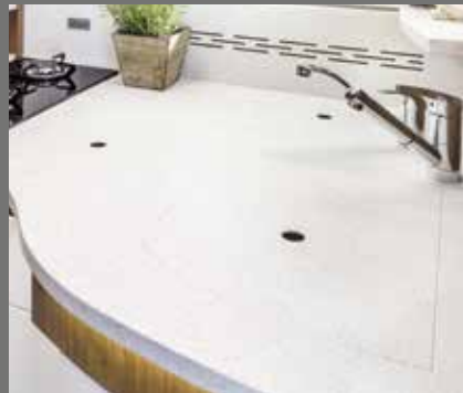
Easy-care kitchen worktop, e.g. high-quality mineral composite