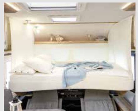
Drop-down bed with power adjustment in A-Class vehicles