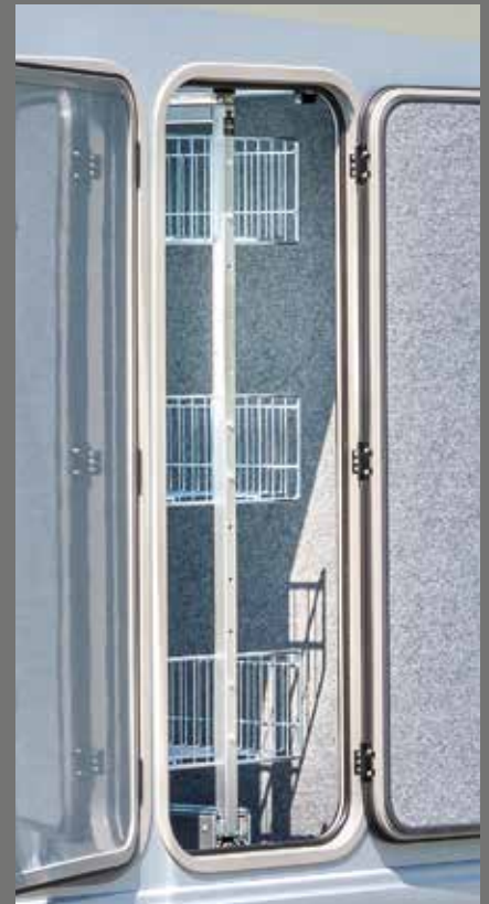
Practical and convenient pull-out system in the rear storage compartment