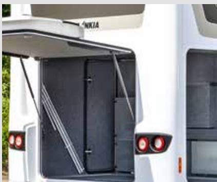
Adjustable rear and side flaps for loading and unloading the storage compartment