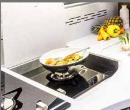
Powerful gas hob