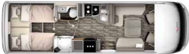
I 840 GD