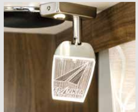
Dimmable reading lights in FRANKIA design with night light function