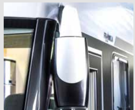
Power heated exterior mirrors