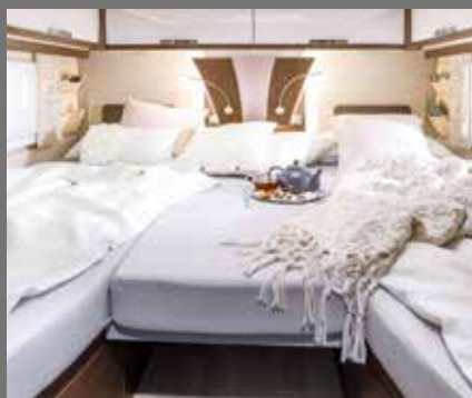
Lots of space: Bed extension for separate beds (GD)