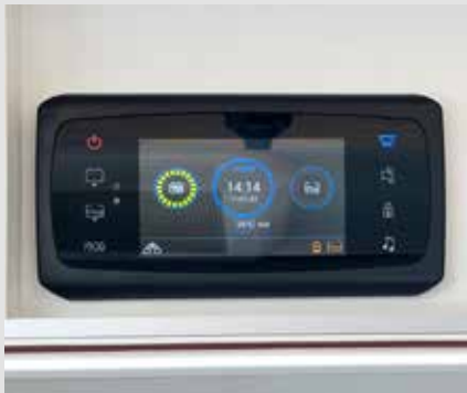
Central control – easy to see and operate