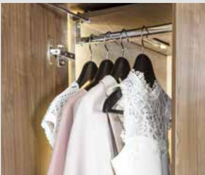
Spacious wardrobes with pleasant interior lighting