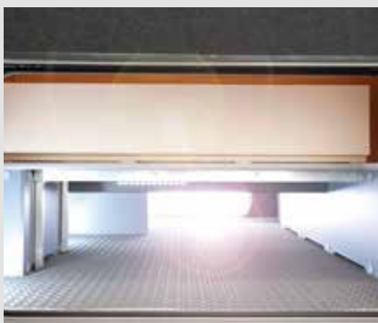
FRANKIA double floor – stepless and heated with a continuous height of 35 cm