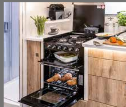
Kitchen column/oven combination (with grill, gas oven, 3-burner hob)