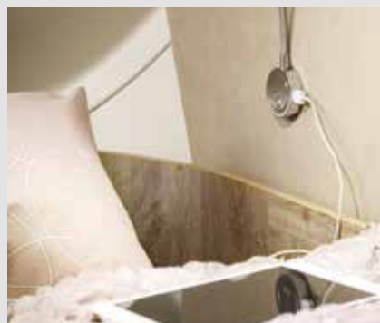
In every FRANKIA motorhome: A number of practical USB sockets