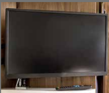
24 inch flat screen TV