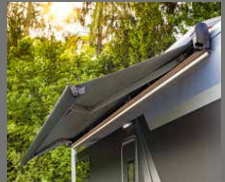
Awning – with optional integrated LED lighting profile