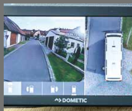
Everything in view: BirdView camera system with 360° view and large display