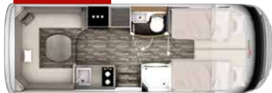
I 680 PLUS