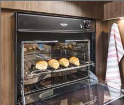
Integrated oven by Thetford