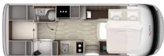
I 680 SG