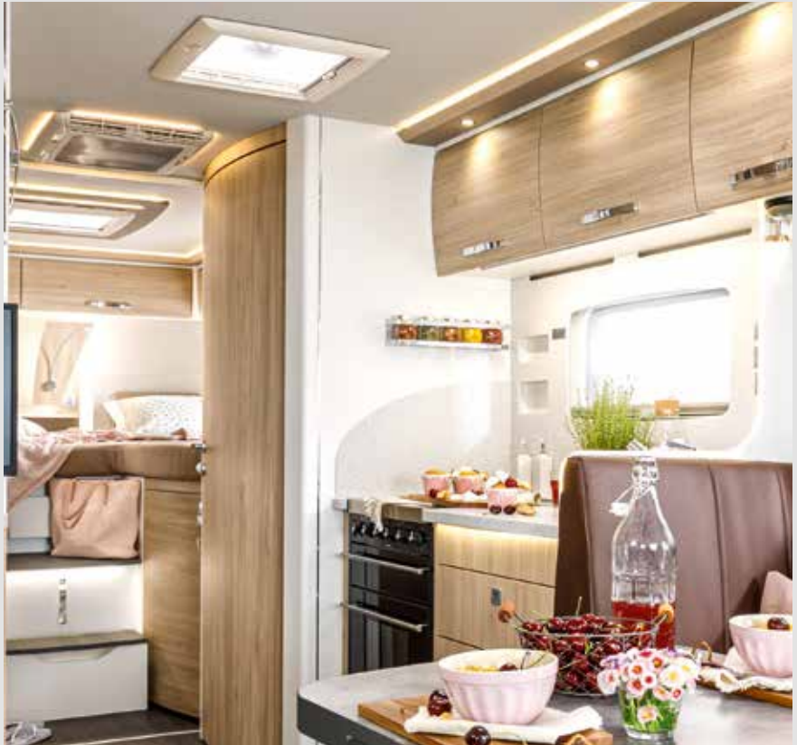
Fits every mood: Dimmable LED lighting