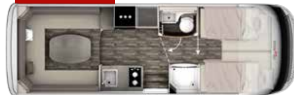
I 740 PLUS