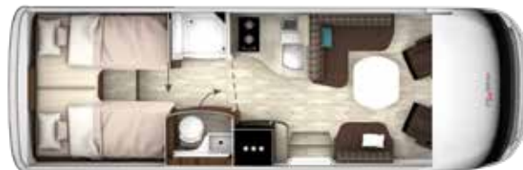
I 740 GD