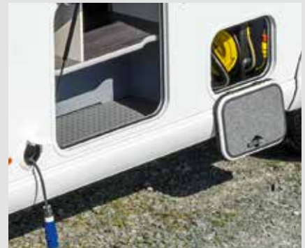
Self-retracting cable reel with 15 m of cable and central supply system