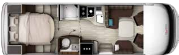
I 790 QD