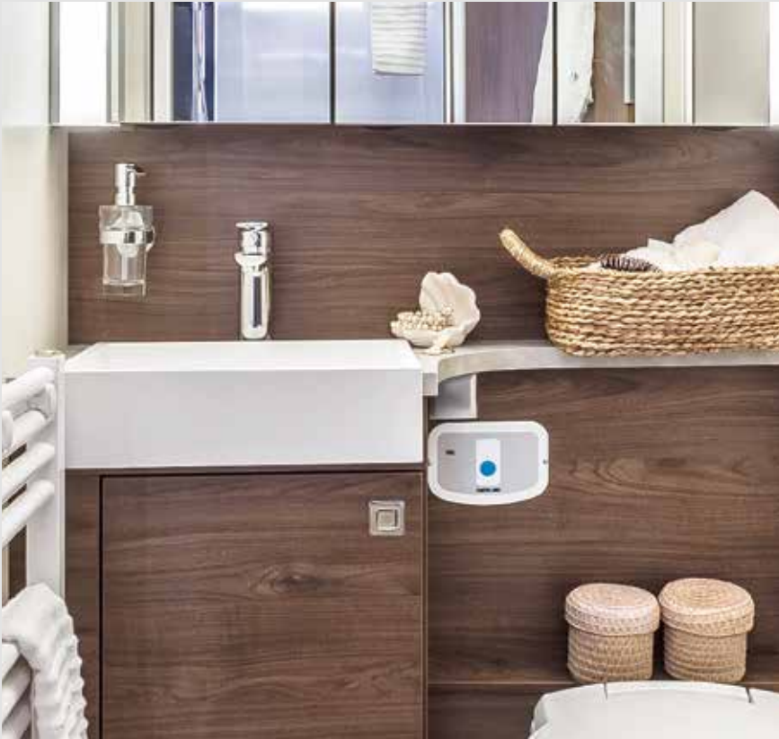
Refreshing elegance: High-quality fixtures in FRANKIA's spa-like bathroom