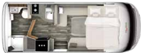
I 640 SD