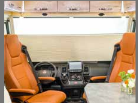
Power front darkening blind with privacy and sun visor function (standard in Luxury)