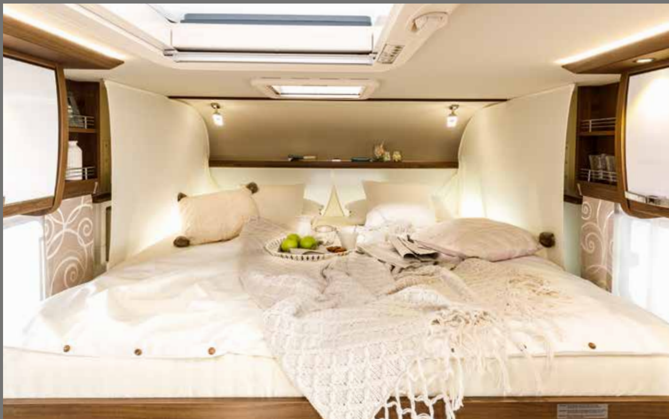
Sleep in any direction: Pull-out FRANKIA Duo bed (2 x 2 m)

FRANKIA F-Line optional equipment (selection)