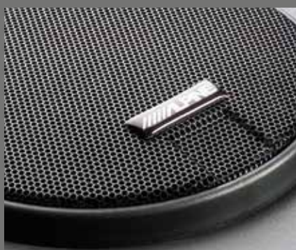
Alpine Dolby Surround Sound speaker system