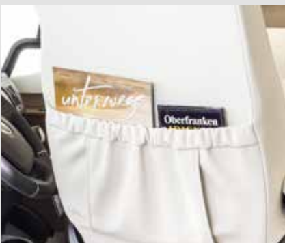
Practical: Pockets on the driver seats (in all FRANKIA A-Class vehicles)