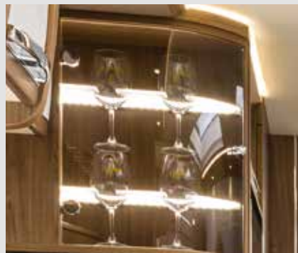
Exclusive cabinet with glass doors for your FRANKIA wine glasses