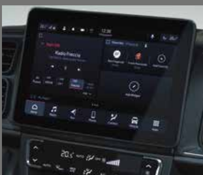
10 inch radio with navigation system