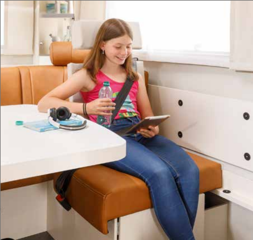
Additional seats with seatbelts in all FRANKIA PLUS floor plans