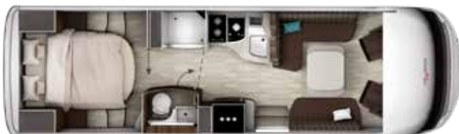
I 840 QD