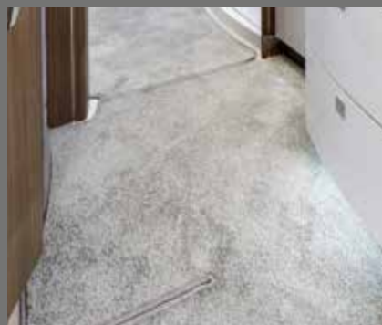
Easy-to-clean carpet throughout the interior