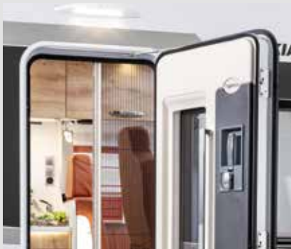
Practical protection: Fly screen integrated in the body door