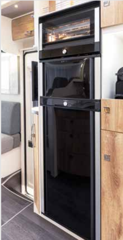
Now the refrigerator and freezer in the TecTower open on both sides