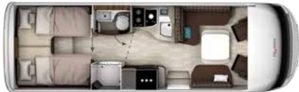
I 790 GD